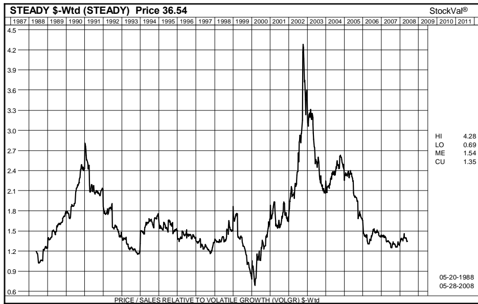
Chart Courtesy StockVal

Implementation: There are many places to find companies with steady earnings growth. Sectors likely to benefit from a rising valuation multiple include Consumer Staples, Utilities, Data Processing, Software, etc. One way to participate in this theme is through a large or mid-cap growth ETF. Two of our favorites are: Powershares Large-Cap Growth (PWB-O-$17.85) and iShares Morningstar Mid-Cap Growth (JKH-A-$99.28)